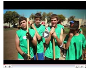
OC Jones Partners with Local Community to Rebuild West Oakland Park

Find out how we're improving our local communities and youth sports. Click here.