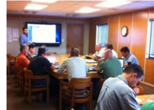
SWPPP Training Class